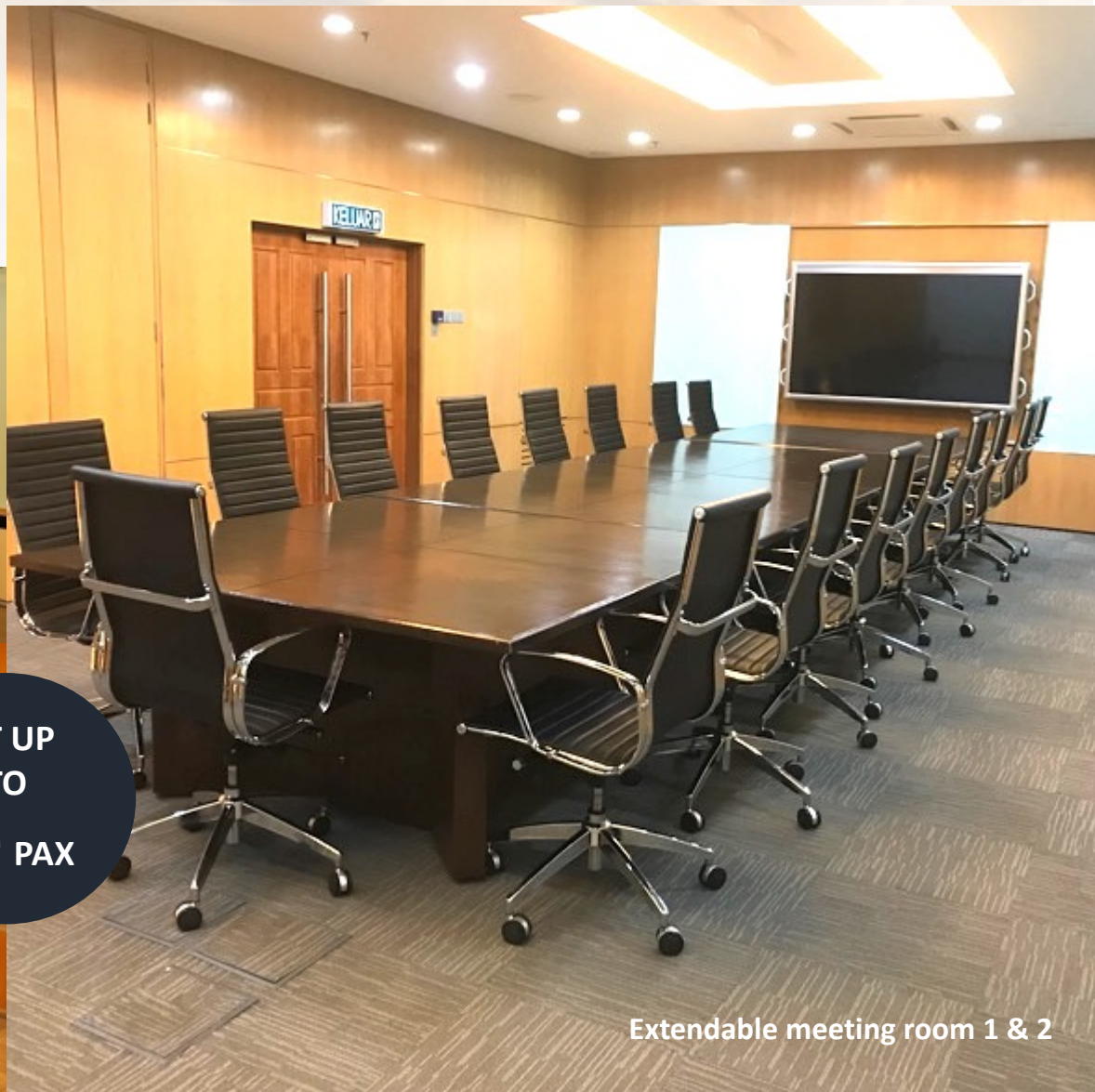
Extendable meeting room 1 & 2