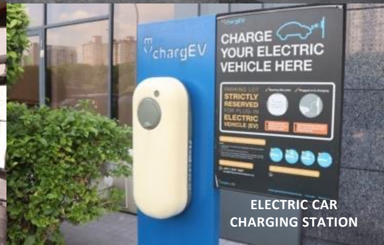
ELECTRIC CAR CHARGING STATION