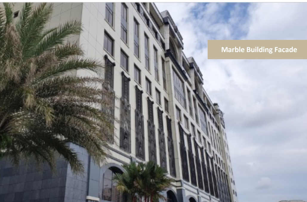
Marble Building Facade