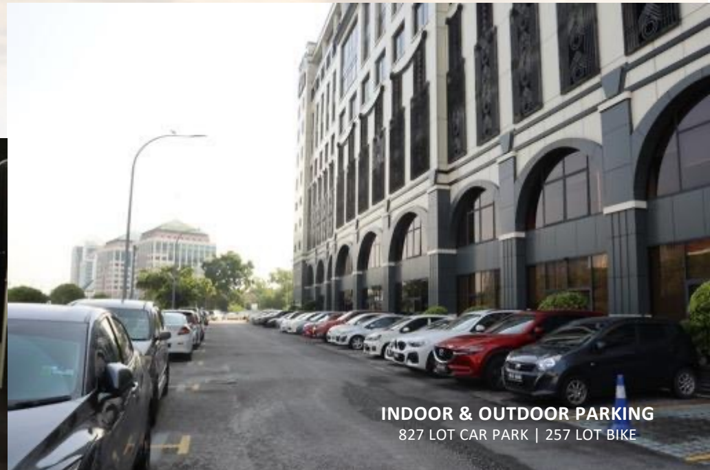
INDOOR & OUTDOOR PARKING 827 LOT CAR PARK | 257 LOT BIKE