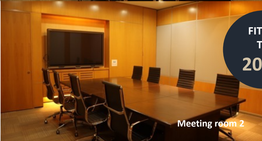
Meeting room 2